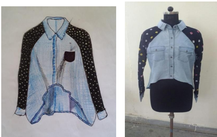
Figure-4 UNEVEN HEM JACKET