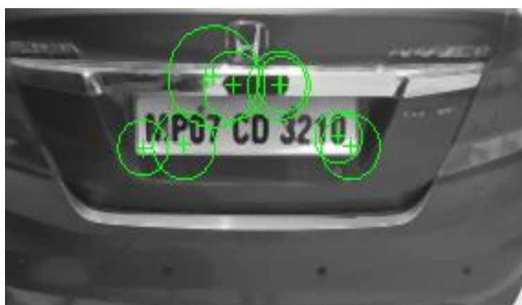
Fig.4 Extracting the feature using SURF