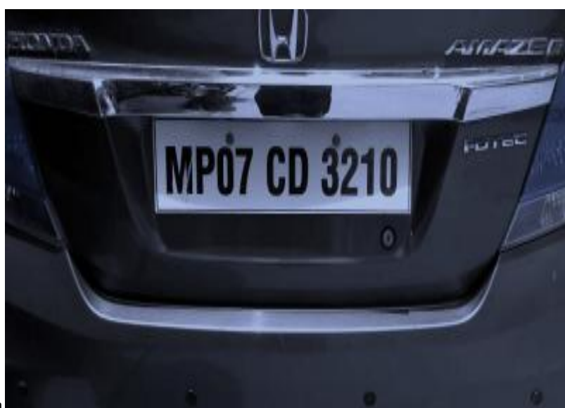
Fig.3 Now remove the noise using median filter