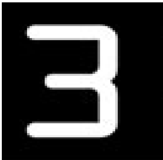
Fig.6 Tamplet matching