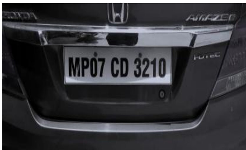
Fig.2 First browse an original from the system