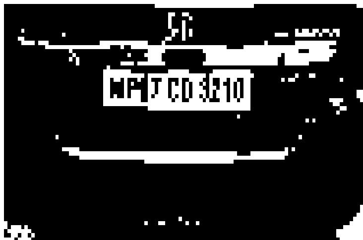
Fig.5 Convert the image into binary image