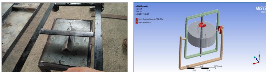
Fig 5.1 Overall design

Since, it is difficult to fabricate prototype from experimental design data, first car chassis is 1/5 th modelled by geometry (geometric similarity). Then gyroscope should be tested on the same. Simultaneously analysis is done with rigid dynamic simulation.