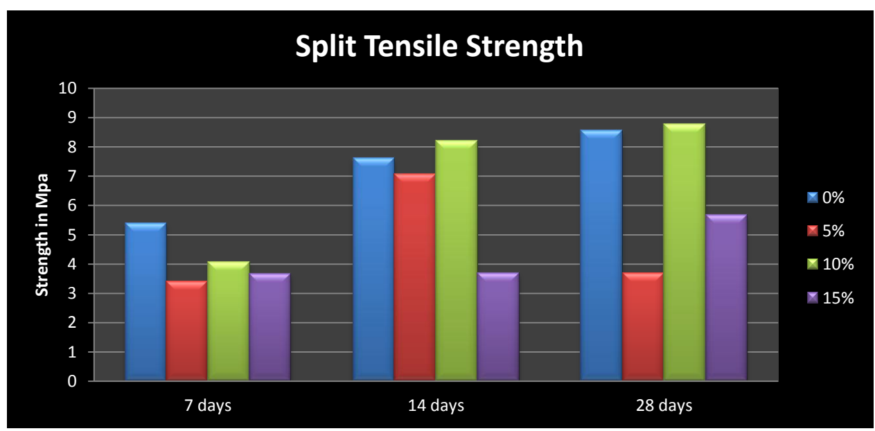
Fig2..Compression Test chart for 7,14,28days