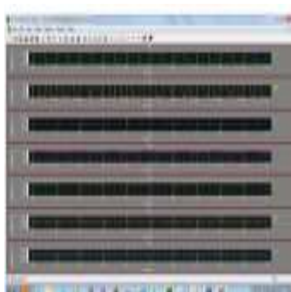
Fig.4.2. Output wave forms.

The schematic design of clock gating for low energy systems and it shows the operation of circuit BY the use of gating methods. On this the clock pulse from clock distribution community is given to XOR GATE. Figure shows the output waveform of clock gating circuit energy consumed by means of using this approach is two.473965e-010 watts.