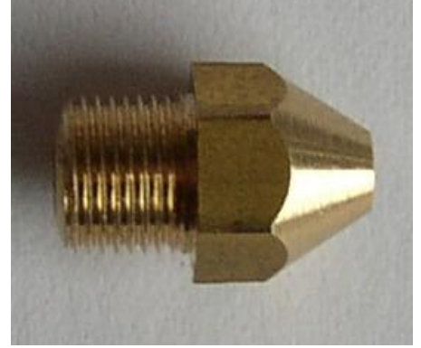
Figure 6: The steam nozzle