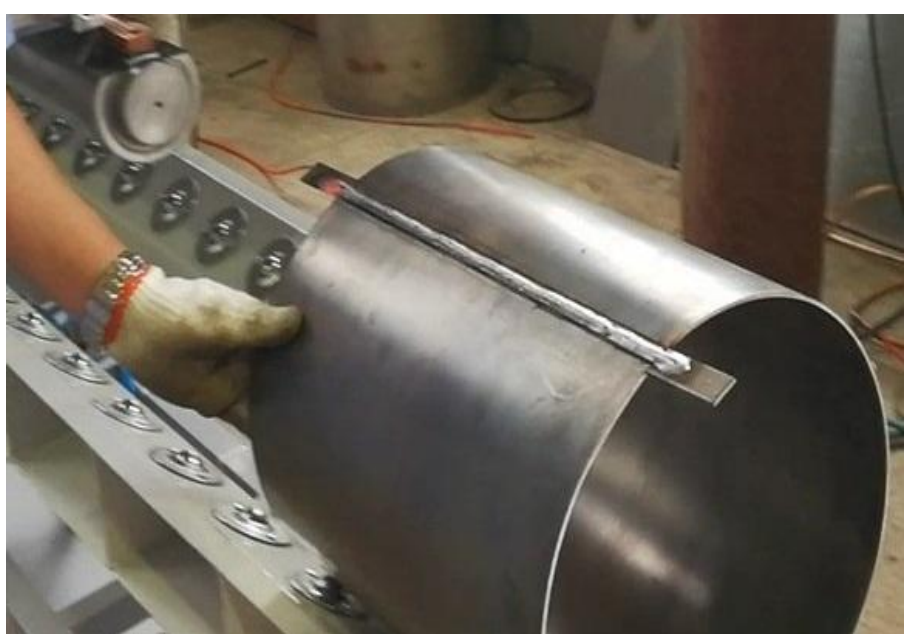
Figure 2: The custom developed boiler cylinder

International Journal of Technical Innovation in Modern Engineering & Science (IJTIMES) Volume 5, Issue 02, February-2019, e-ISSN: 2455-2585, Impact Factor: 5.22 (SJIF-2017)