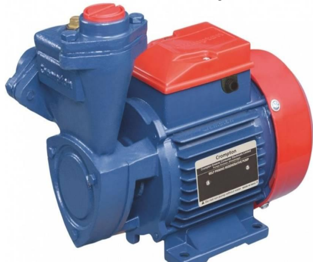
Figure 3: The 2 hp water pump (Crompton make)