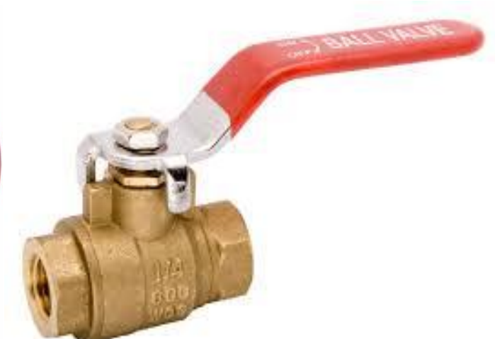
Figure 4: The ball valve for flow regulation