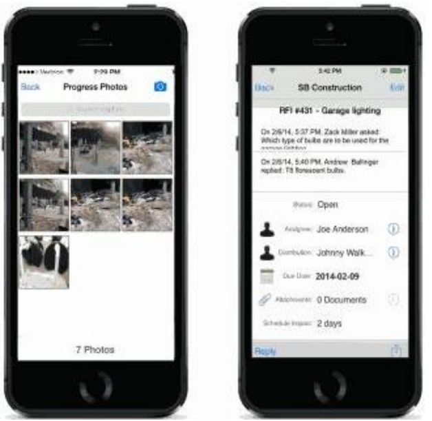
Fig 2: Pictures of Construction site shown by the app

There are two type of data required for the operation of the App of procurement management. These are as: