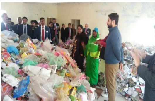
Figure 2: Team from international defence collage reviewing the program

Collection of waste and segregation in stipulated time is very important, if segregation is done within 8 hrs of collection biodegradable waste can be used for animal food, making compost etc. It was observed that within a month in a village good amount of solid non bio degradable waste can be collected, cleaned like newspapers, bottles, bottle caps, egg shells, and other thing. Egg shells cleaned, dried and powdered to be used and good nutrients in many plants. Many of such items have good reusable quality and many can be converted to use in productive forms. Dry leave manure is made by collecting all dry leave and making six by eight fit loaf, adding liquid dung, cover it for 45 days with rug sheets. This manure can be used for agricultural fields and it is much better than inorganic manure used in field.