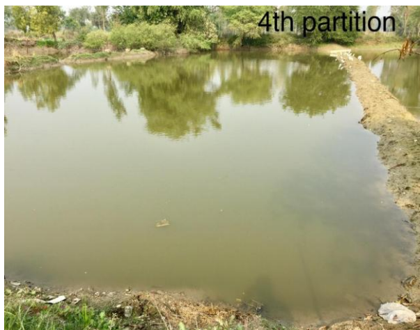
Figure 5: Waste Stabilisation Pond (WSP) in Lalpur: Anaerobic Tank, Facultative tank, maturation tank and clear water tank