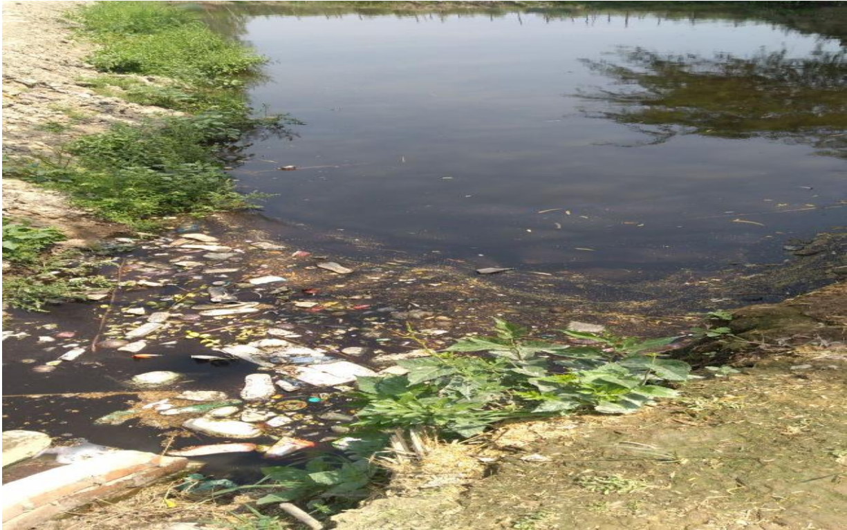
Figure 4: Initial condition of pond- Liquid and solid waste going into village pond