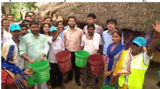
Figure 1: Chief Development Officer, Lucknow distributing dustbins to village people

In Uttar Pradesh, situation of waste collection is equally poor. In current year state Swacch Bharat Mission has put lot of efforts towards making the villages open defecation free. Once these gram panchayats are made ODF which is just stopping open defecation by communities and using toilets, there is need to put additional efforts to make communities cleaner,