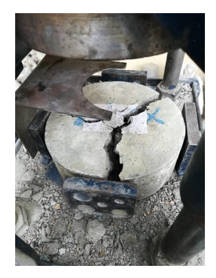
Fig 3: Failure of specimen (M35)