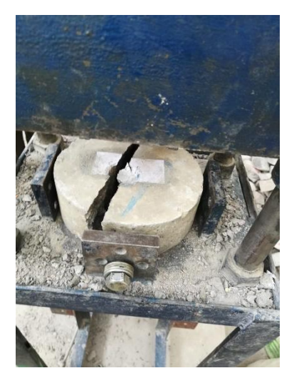
Fig 4: Failure of specimen (M45)