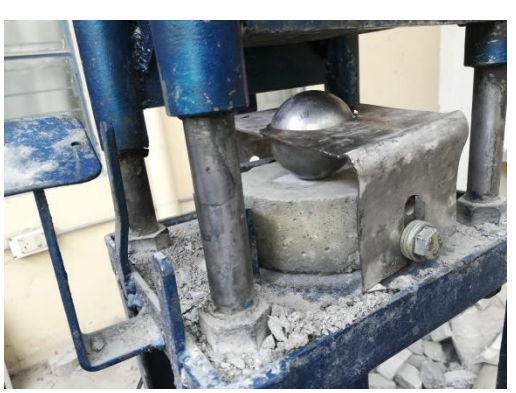
Fig.2: Steel ball placing at center of specimen