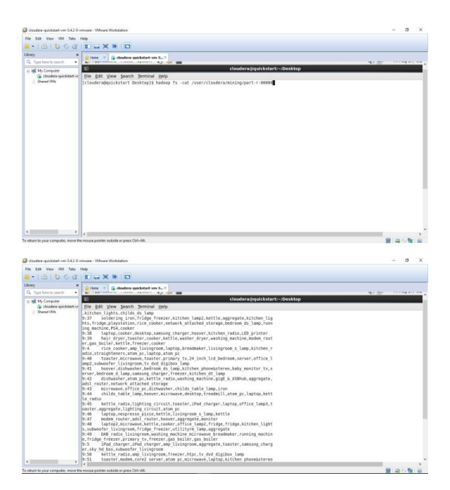
Fig.6 View Results