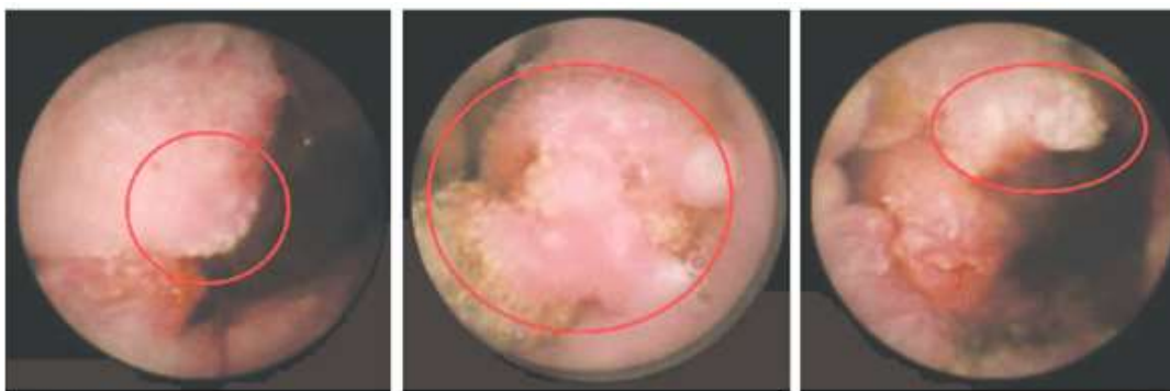
FIG II: Abnormal case

properties of the image, and could be abstractly portrayed as fine, coarse, smooth, arbitrary, undulated, and unpredictable, and so forth. In this Purposed work Above kind of Wireless Capsule endoscopic image are attempting to arrange in our undertaking.