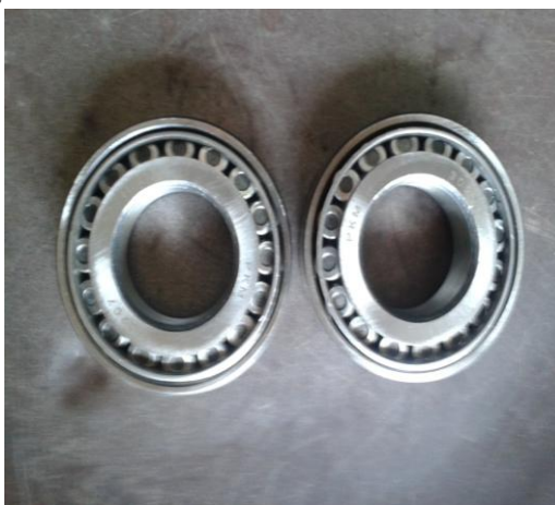
Fig. 7 Bearings

The bearings are used for smooth operation of shaft. To avoid friction between shaft, rotor and pulley. In this model used bearings has inner diameter of 3.5cm and outer diameter of 7.2cm. Bearings are generally provided for supporting the shaft and smooth operation between the connecting parts. The used bearings in VAWT as shown in the Fig.7 below