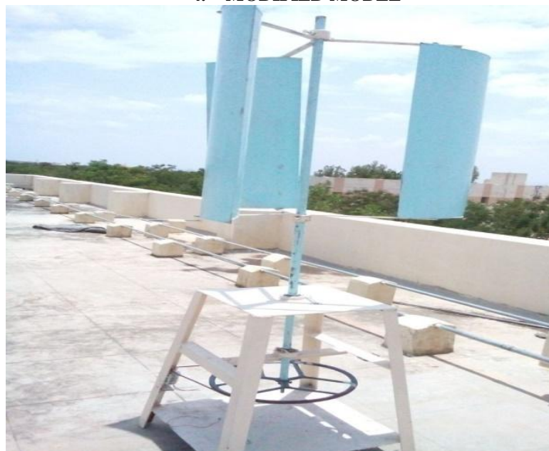
Fig-3: Modified model of VAWT

The modified model of vertical axis wind turbine as shown in Fig.3 it consist of blades, pulley, permanent magnetic dynamo, shaft, stand, rotors, pulley. Here the pulley and dynamo connected with driven belt. Shaft is attached to the pulley by contact of bearing to avoid the friction between the pulley and shaft, and at top of the shaft rotors are attached at suitable distance. Rotor blades are rigidly fixed to the rotors at the blade angle is 15^{\circ} and in this setup Omni metre is not used to measure the velocity flow of air and direction of flow.