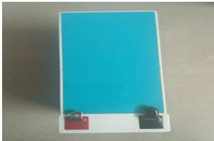
Fig.6 Rotor Blade