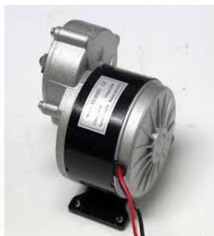
Fig 5. 24V Dc motor

In Segway Dc motor is one of the important component. In this Segway type of Dc “shunt motor “is used and DC motors works the input of the type of brushless Dc motor is current by voltage and DC motor output is torque. In Dc motor Shunt motor is one type, it is a constant speed motor and the speed is almost constant and from the no load to the full load. Loads are driven at a number of speeds and the any one of the constant Brushless Dc motors. Brushless Dc motors are different uses they are reliable is more, efficient is more, and noisy is less. The recent times many vehicles uses the type of brushless Dc motors. Brushless Dc motors are used in most of the present modern devices. Brushless Dc motor efficiency is 85-90%. Brushless DC motors are suitable for the different applications high speed, another application of the DC motor is control and better speed