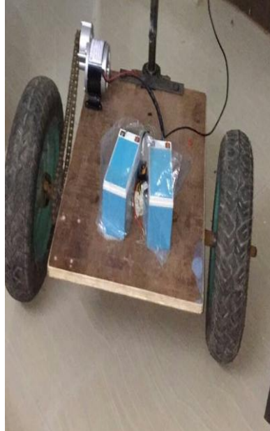
Fig 4. Frame of the modified Segway model

In Segway frame is the most important part. The detailed view of the frame of modified Segway model is shown in Fig 3. The Segway wheels as shown in this base frame. Dc motor is fitted on the base frame plate.