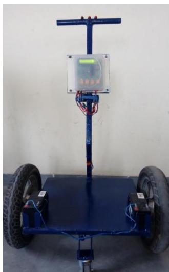
Fig 1.Existed Segway model

This Segway mainly having two wheels, frame, battery, motor .this Segway is carrying capacity is 60 to 70 kg. This Segway is manually operated. This Segway not having braking system.Base plate is made with iron due to high strength. In this segway power is transfer between the wheels and the motor for movement and motion. This Segway is Dc motor fitted on the rod and batteries are mounted on the base frame plate. The main problem in this Segway is ,balancing is less and safety is less and does not have breaking system.