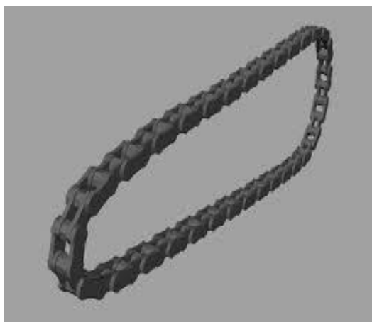
Fig 10.chain drive

Chain drive is mainly transmitting the mechanical power from the one place to another place. Chain drive is used as power transfer to the wheels of the vehicles, mainly in bicycles and motor cycles. Chain drive is also used in many different vehicles and many different machines.