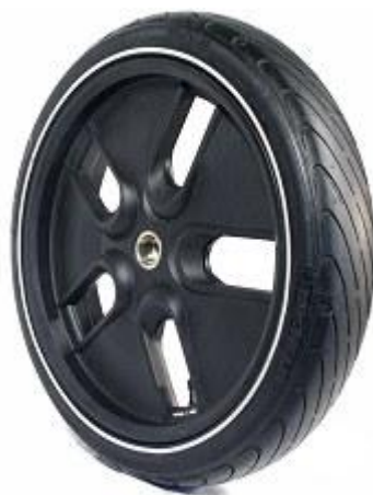
Fig 8. Wheels

In many different vehicles wheels are used. They are used for moving vehicles and transportation. In this Segway two wheels are used and another supporting wheels are added for more supporting purpose. Wheels are used in many different ways in different vehicles. Wheels as shown in Fig 7.