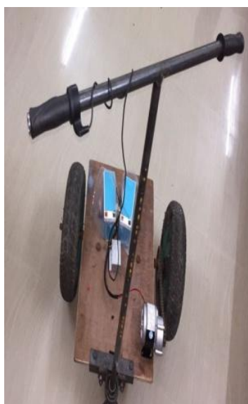
Fig 3. Modified Segway model

Modified Segway model is shown in Fig 3. It contains base plate, wheels, handles, Dc motor and the batteries. Dc motor is fitted on the base frame plate and batteries are also fitted on the base frame plate. This Segway is making with a T-shape control shaft fitted into a base frame fit on the parallel two wheels. This device is not having brakes and accelerator, but it is a handgrip for making different turns in segway. It is the only vehicle able to turn in different places just like a human person, because its wheels are turns in different directions. This Segway is faster than the human walkers more than three times. Segway emphasis creating light weight and low cost system. Their low costs make them affordable and light weight make them portable in anywhere. The drive mechanism is main important part of the any automobile. In this segway charged to the drive motor for drive mechanism includes one DC motor, two rechargeable batteries. In this segway one type of drive is wheel drive and In segway two wheels are working as a driving wheels. Segway power is transfer from the motors to the wheels independently and separately.