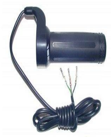
Fig 6. Throttle

The function of Throttle is controls the speed. It is commonly maintain in a motor cycle's for gripping to control the throttle , but it is sometimes acts as a bicycle gearshift. Throttle diagram is shown in fig 5.