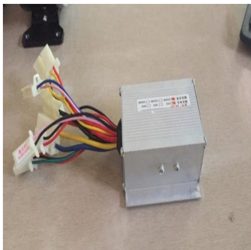
Fig 7. Speed controller

Speed control is an electric circuit and speed control is change the speed of the electric motor, speed controller acts as a dynamic brake. These are frequently used on the vehicles controlled vehicles which are electrically powered, change the most frequently used for motors brushless motors are basically providing an electronically produced low voltage sources of energy for the motors in 3-phase electronic power . The electronic speed control system acts as a remote control and applications of the vehicles are in Electronic cars and Electronic bicycles. Speed controller as shown in Fig 6.