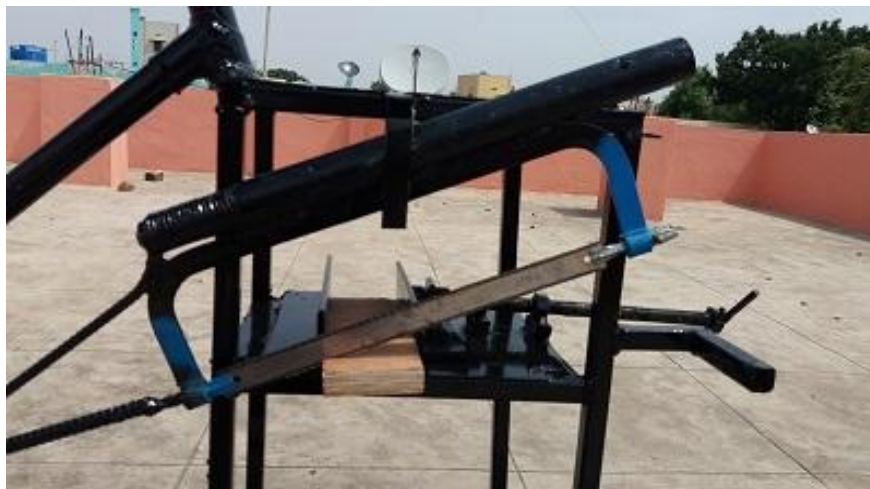
Fig 3: Fabricated pedal powered cutting machine